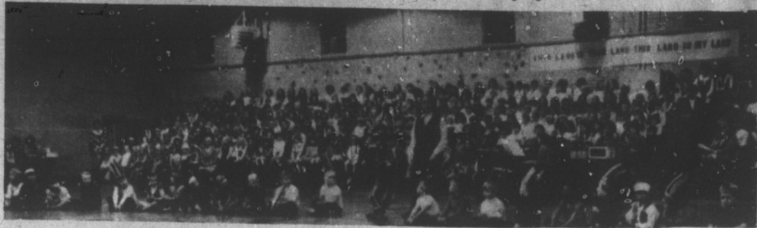
Kindergartners Sang '10 Little Indians' And Performed Skit

The Burnsville Elementary Students and their parents and friends had a big night November 2nd, at their annual Harvest Festival. Students and their teachers worked many hours to perfect their part 'n the program.