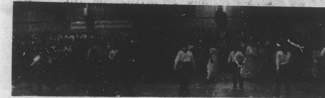
4th Graders Danced A Terrific 'Virginia Reel'