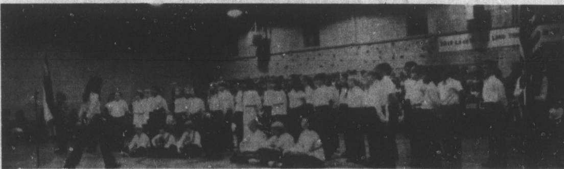
6th Graders Ended Program With A Medley Of Patriotic Songs