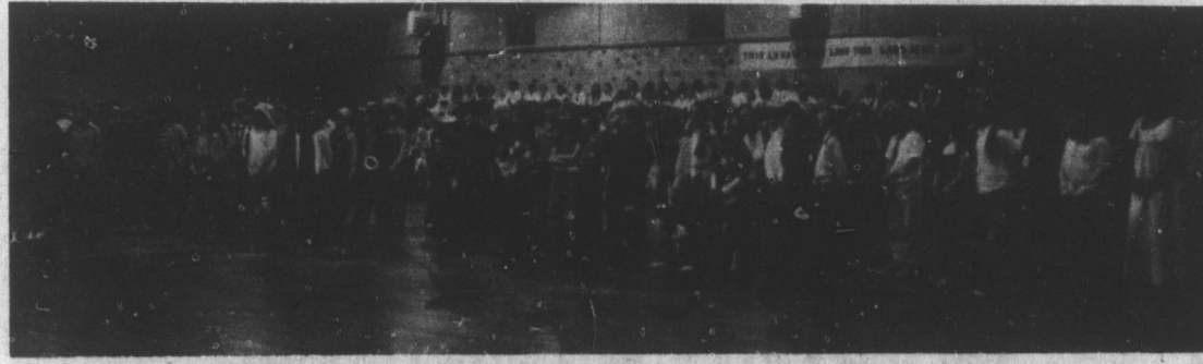
5th Graders Sang 'Happy Wanderer' And Dressed The Part With Patches And Hats