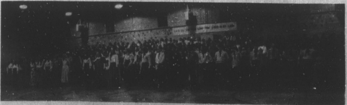
7th Graders: American Folk Songs Provided The Music Theme