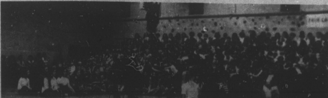
8th Graders Grouped Around A Guitarist To Sing 'One Tin Soldier'