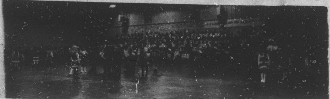
1st Graders Performed A Cowgirl And Cowboy Dance 'Swing Your Partner'