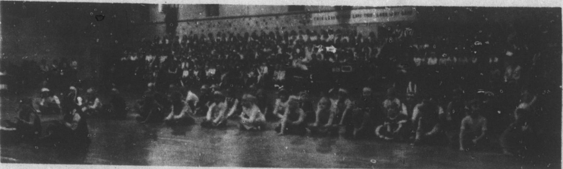
2nd Graders Sang An Indian Song Complete With Tom-Toms