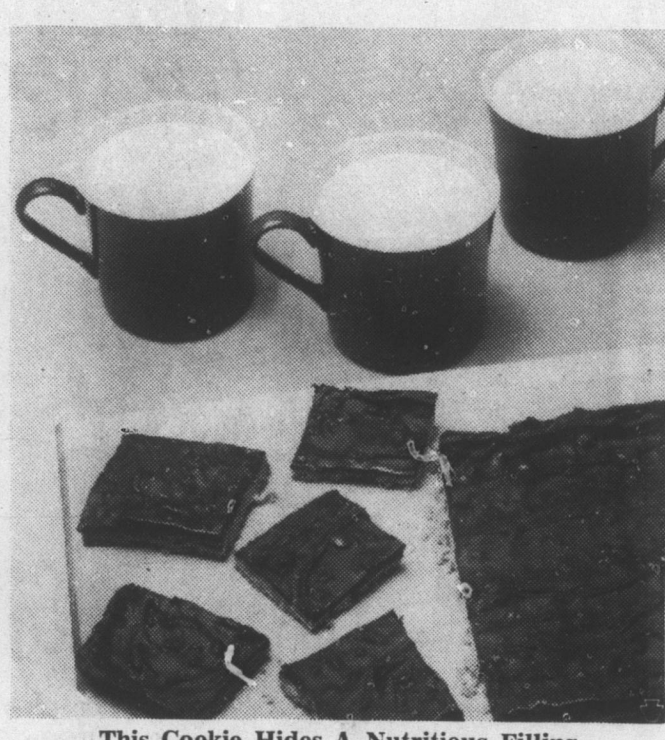
This Cookie Hides A Nutritious Filling

Some of the best cookie bars are those that are made in layers. First a cookie dough is baked. That's the bottom layer. Then comes the filling which varies considerably from apricot jam to coconut, dried fruit or nuts. And last, a topping such as baked meringue or unbaked chocolate coating.