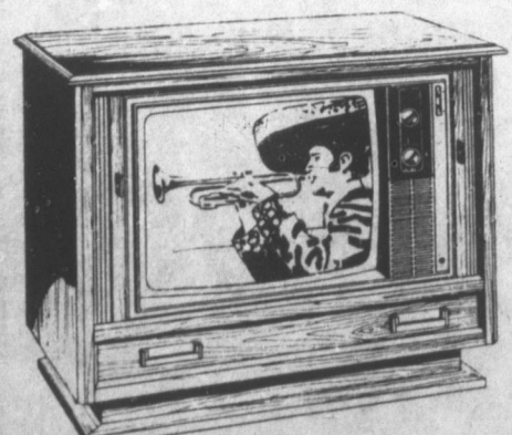
The SAHARA • E4715W Distinctive Modern styled console with simulated tambour doors and recessed full base. Finished in grained Walnut color. Titan 101 Chassis. Solid-State Super Video Range Tuning System. AFC. Illuminated Channel Numbers.