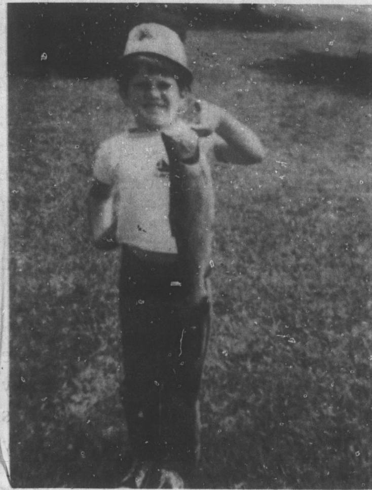
I Got One!

Mt. Wilderness Civil Air Patrol will meet every Monday night at 7:30 p.m. at the Mountain Wilderness Office, Pensacola, N.C. Anyone interested in joining this group will be welcome to attend any Monday night meeting. All visitors are welcome.