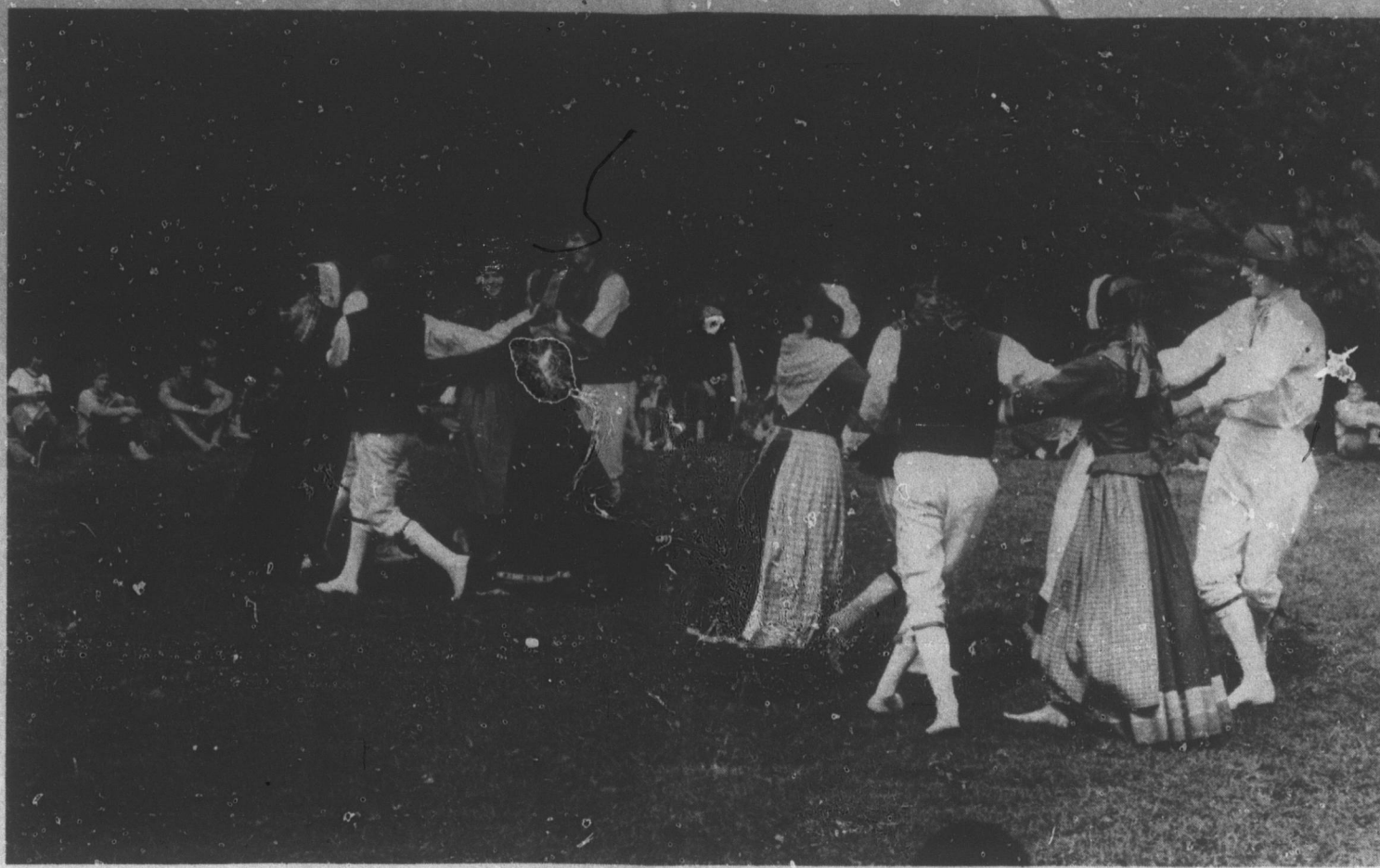
Young Danish Men And Women In Folk Dance

Each week we present the above comments for your information. We very much appreciate your readership and would be especially happy to have you express your views regarding the contents of this space.