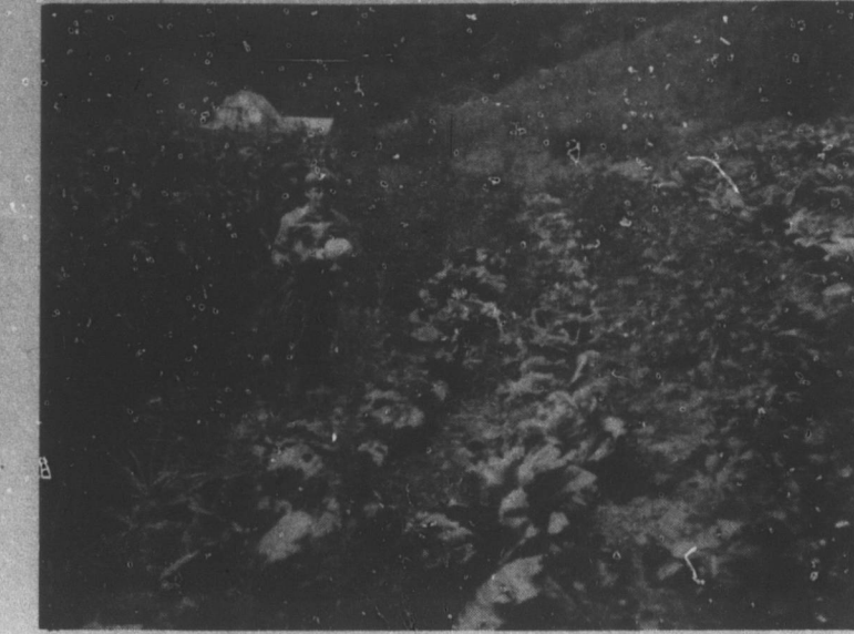
Eddie Ogle Grew Strawberries, Watermelons