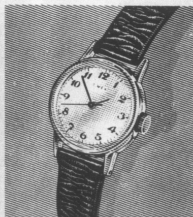
(b) A lady's Petite watch with sweep second hand. Free with deposit of $500 or more.