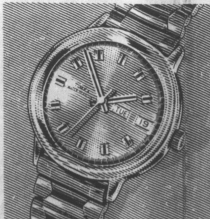
(c) A man's Marlin day-date calendar watch, water and dust resistant, with chrome-plated bezel, link expansion band and sweep second hand. Free with deposit of $5,000 or more.