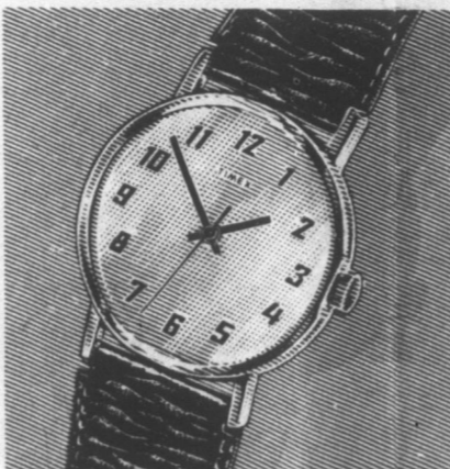
(a) A man's Mercury watch with sweep second hand. Free with deposit of $500 or more.