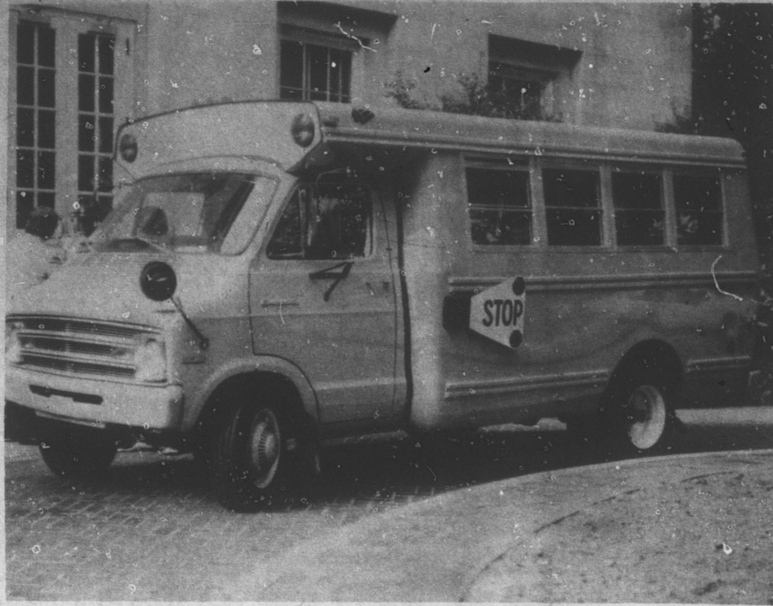
Mini-Bus Aids Child Development Programs