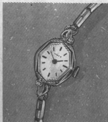
(d) A lady's Cavatina watch with two 8-facet diamonds and expansion bracelet. Free with deposit of $5,000 or more.