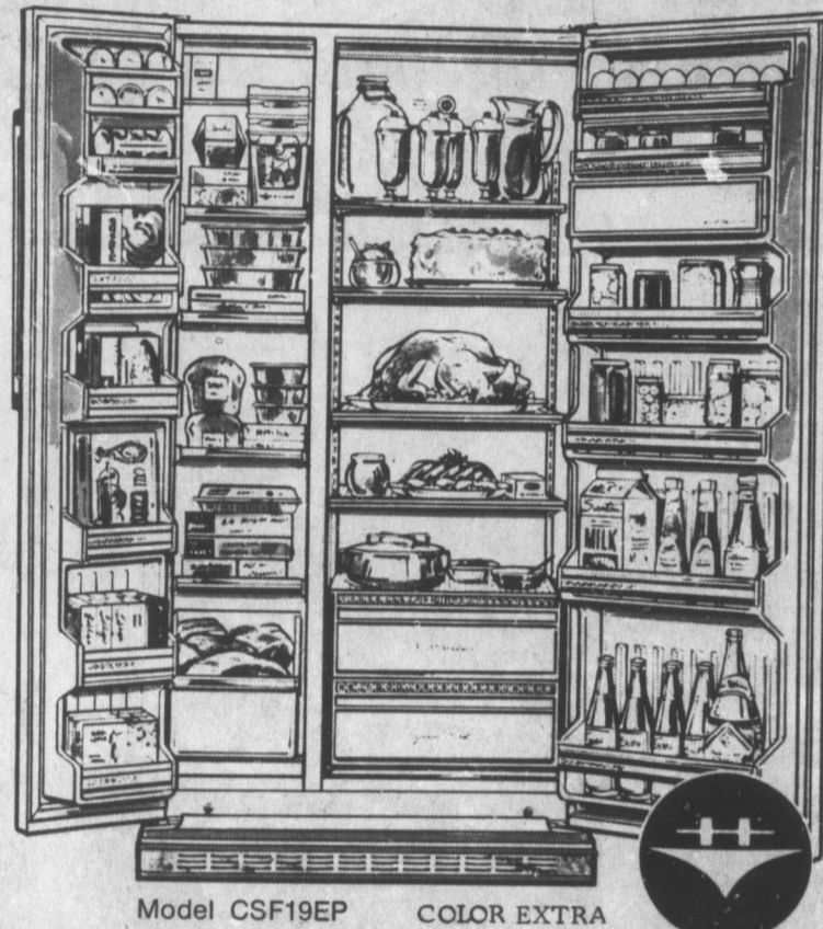
Model CSF19EP COLOR EXTRA

Hotpoint THE H ONE gets into some pretty tight spots