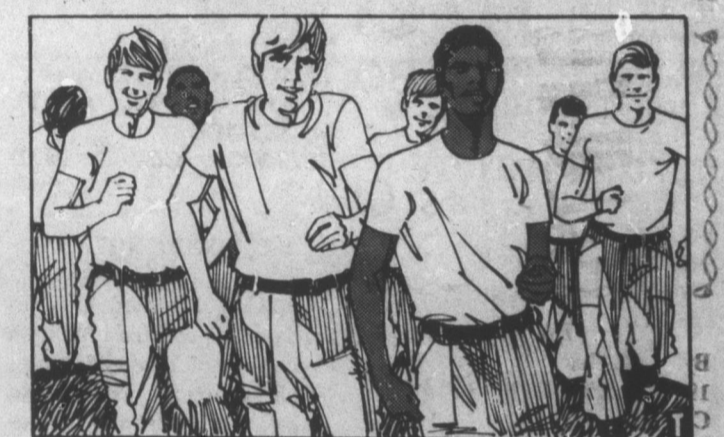
You can spend one very different and very demanding weekend a month. In the Army Reserve.

All people who would like to see the girls in Bald Creek School District have an opportunity to become members of a world-wide organization are urged to attend Monday's meeting.