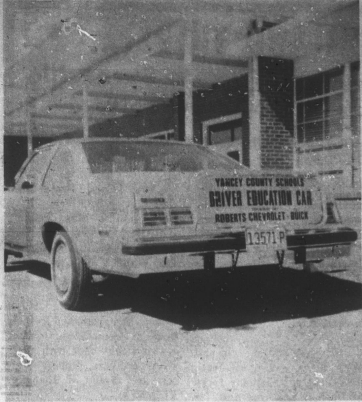
Student Drivers Get New Car

What's new at Cane River is a new car. At least that's what one student has to report in this issue of Cane River News.