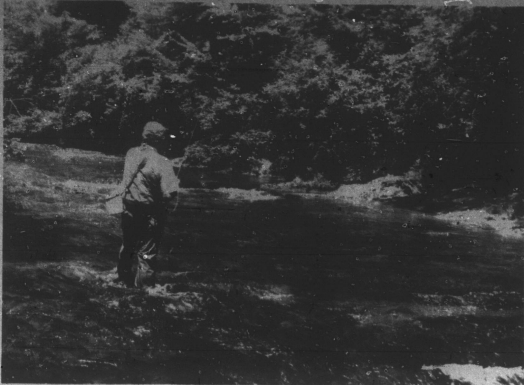
Fishing N.C. Streams And Rivers Is Favorite Sport

Mt. Wilderness Civil Air Patrol will meet every Monday night at 7:30 p.m. at the Mountain Wilderness Office, Pensacola, N.C. Anyone interested in joining this group will be welcome to attend any Monday night meeting. All visitors are welcome.