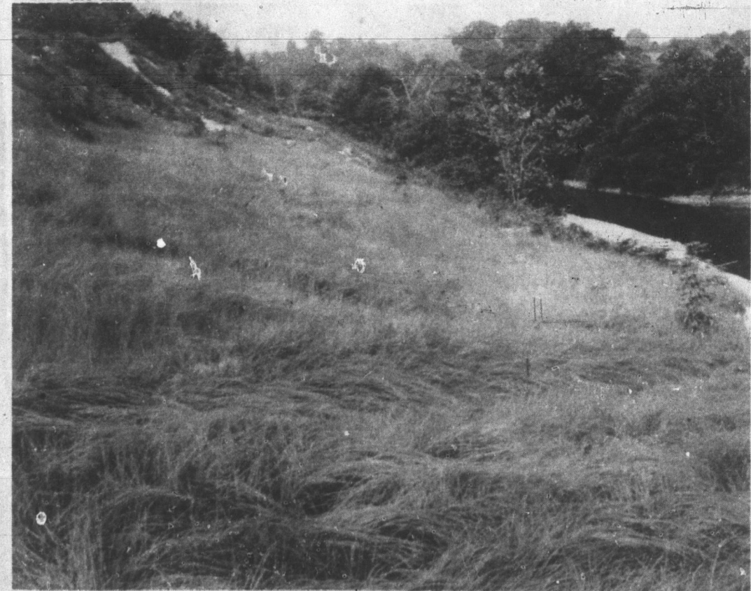
AFTER . . . . Carpet Of Grass Restores Natural Look