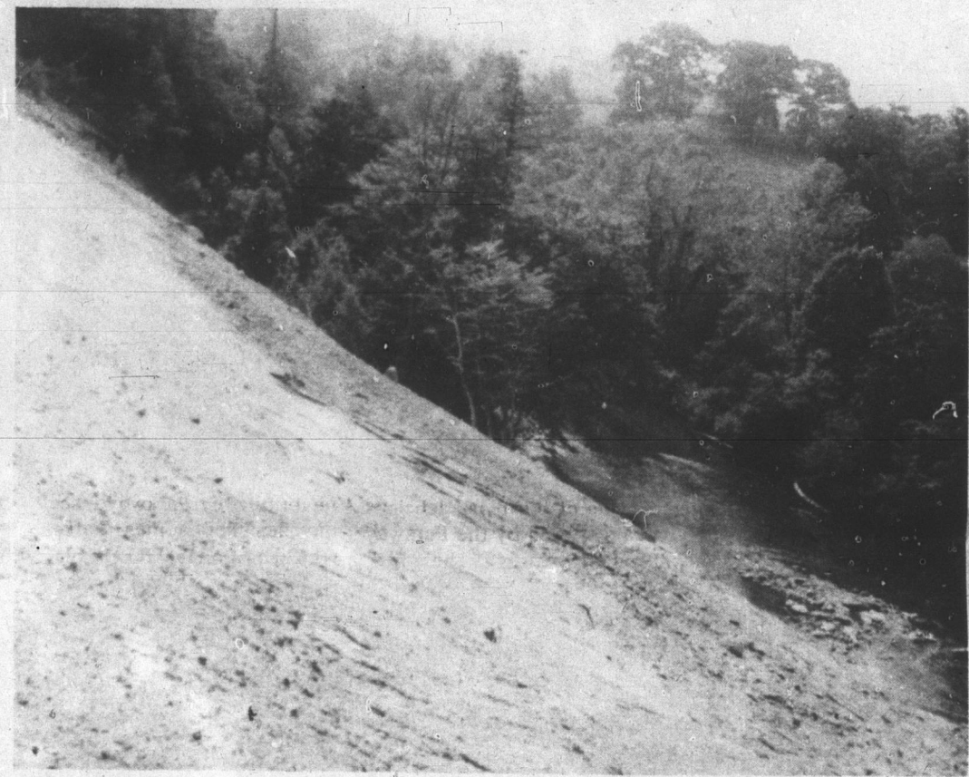
BEFORE . . . . Wasteland Of Tailings From Mica Mining

with environmental specialists for solutions to the constant problem of providing the nation with raw materials without destroying the land from which it comes."