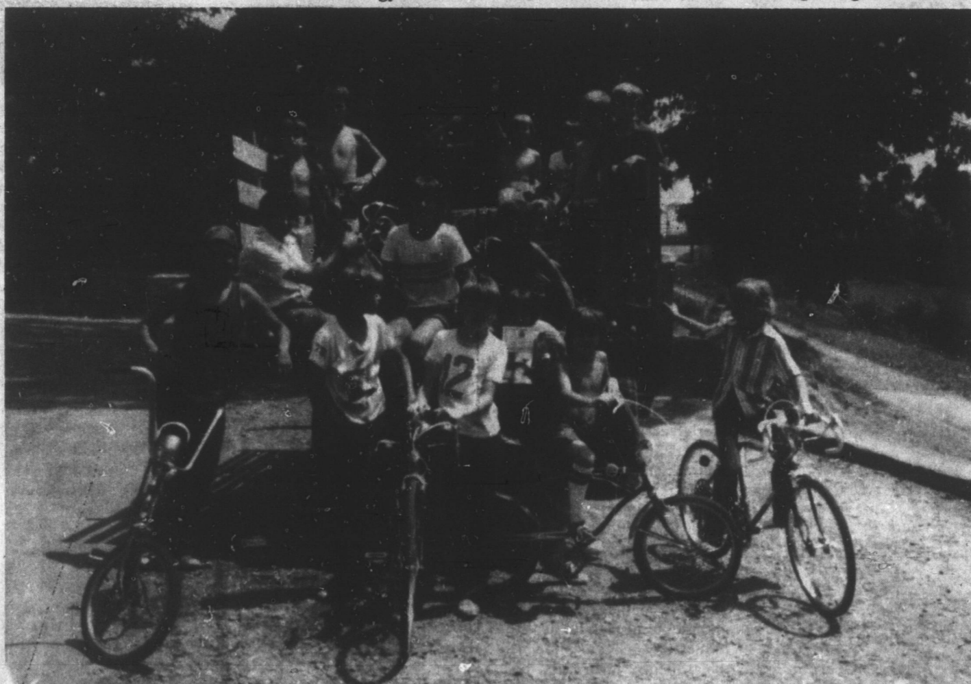
Action & Adventure Participants Attend Activity Day Events