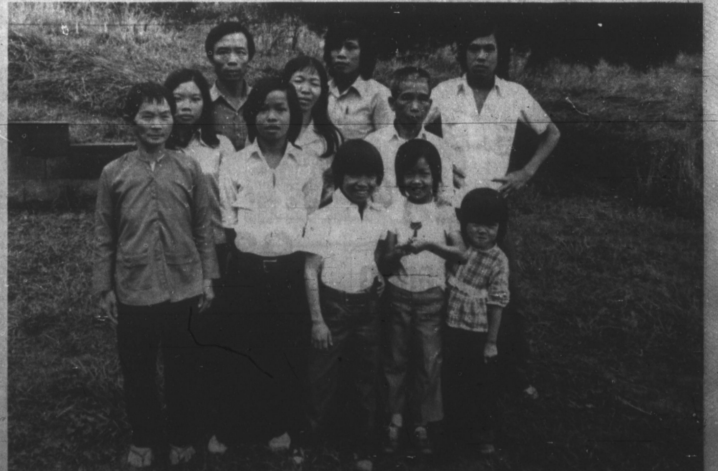
Vietnamese Family In Burnsville Includes Six Adults And Five Children