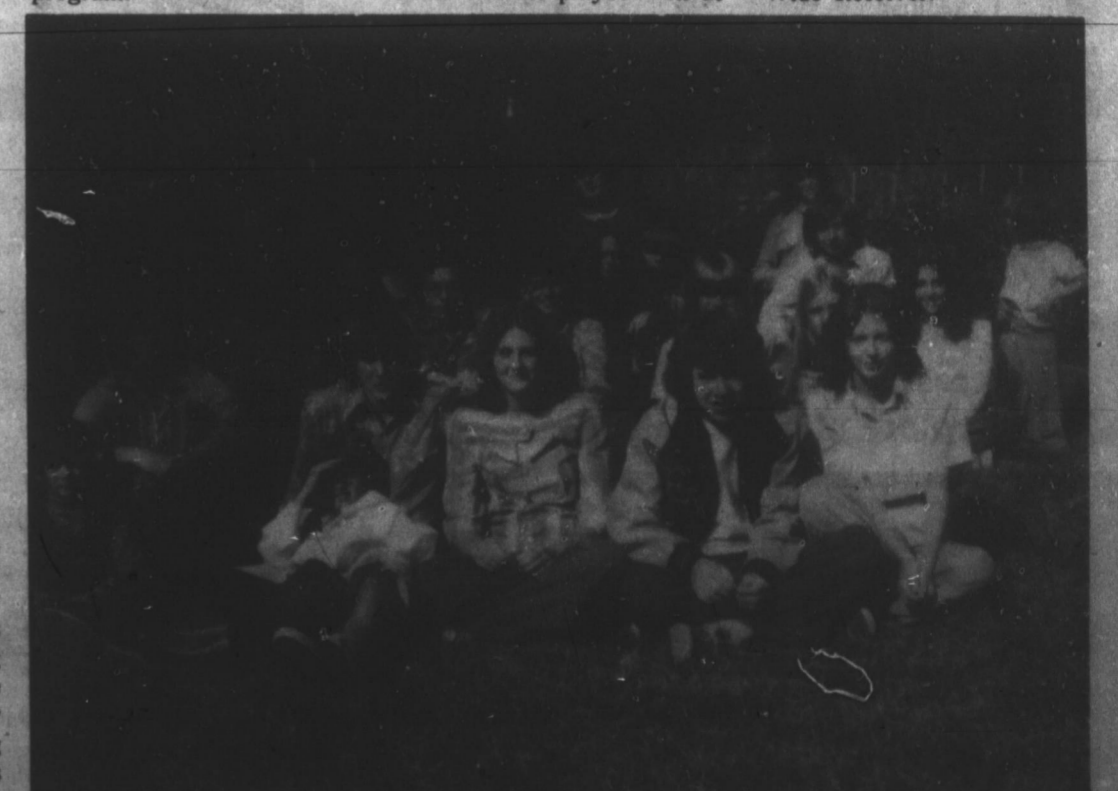
Mountain Heritage Team And Cheerleaders At Picnic