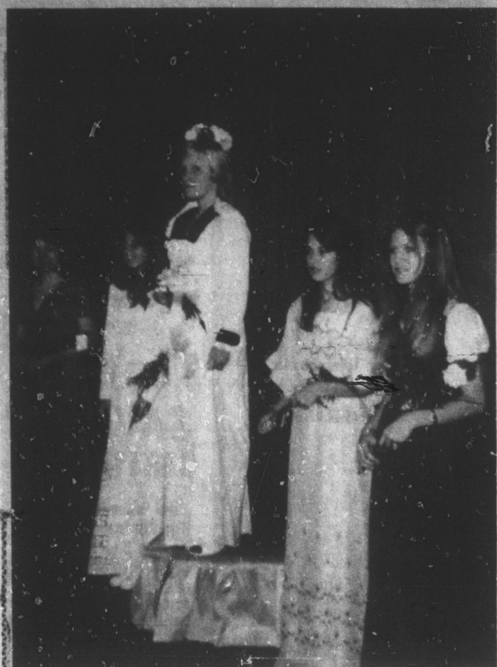
Miss Bicentennial 1976 Queen, Court