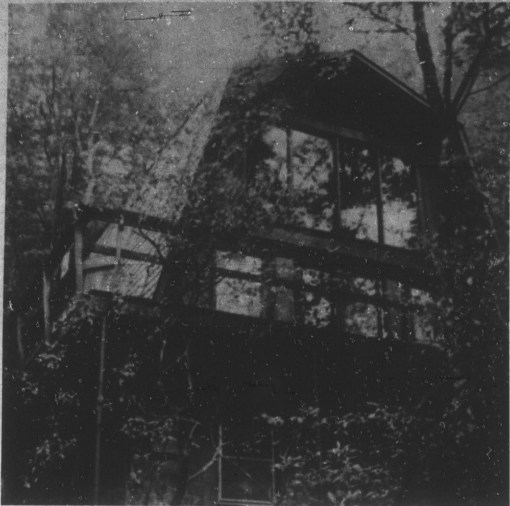
One Of Many Vacation Homes At Golf Resort

For more information on Mount Mitchell Lands or the golf course, call 675-5454 or 675-4923. The sales office and pro shop are located on N.C. Hwy. 80 South, 16 miles from Burnsville.