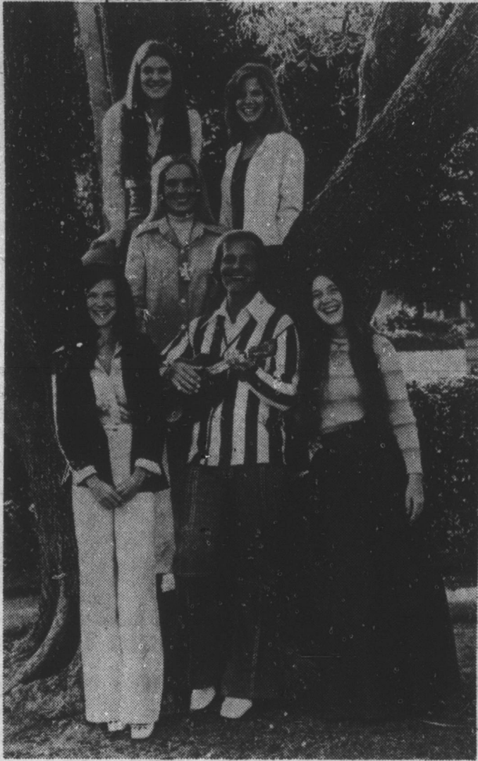
Pat Boone And Family

The Freedom Edition Bible is not for sale in stores, but is offered by this newspaper through mail order.