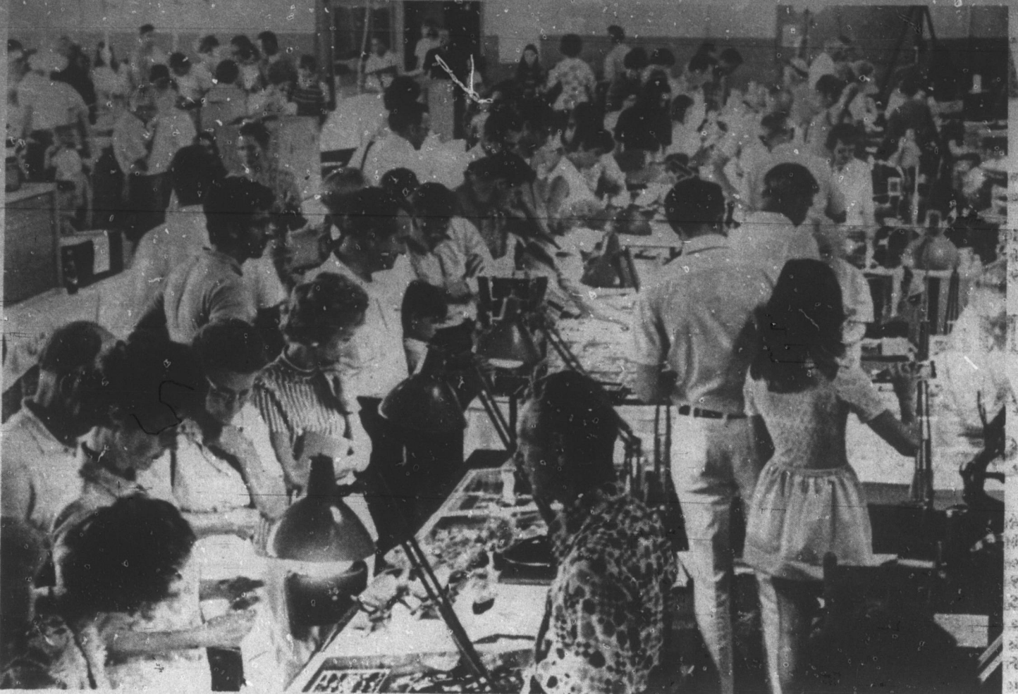
Hundreds Attend Spruce Pine Mineral And Gem Festival Annually