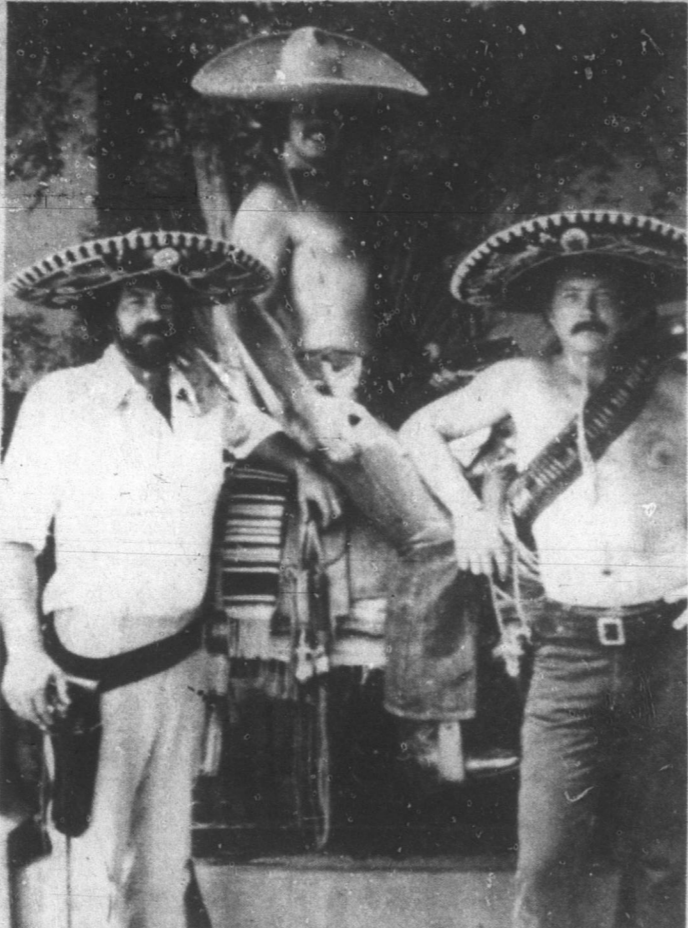
"Bandidos" Return From Mexico