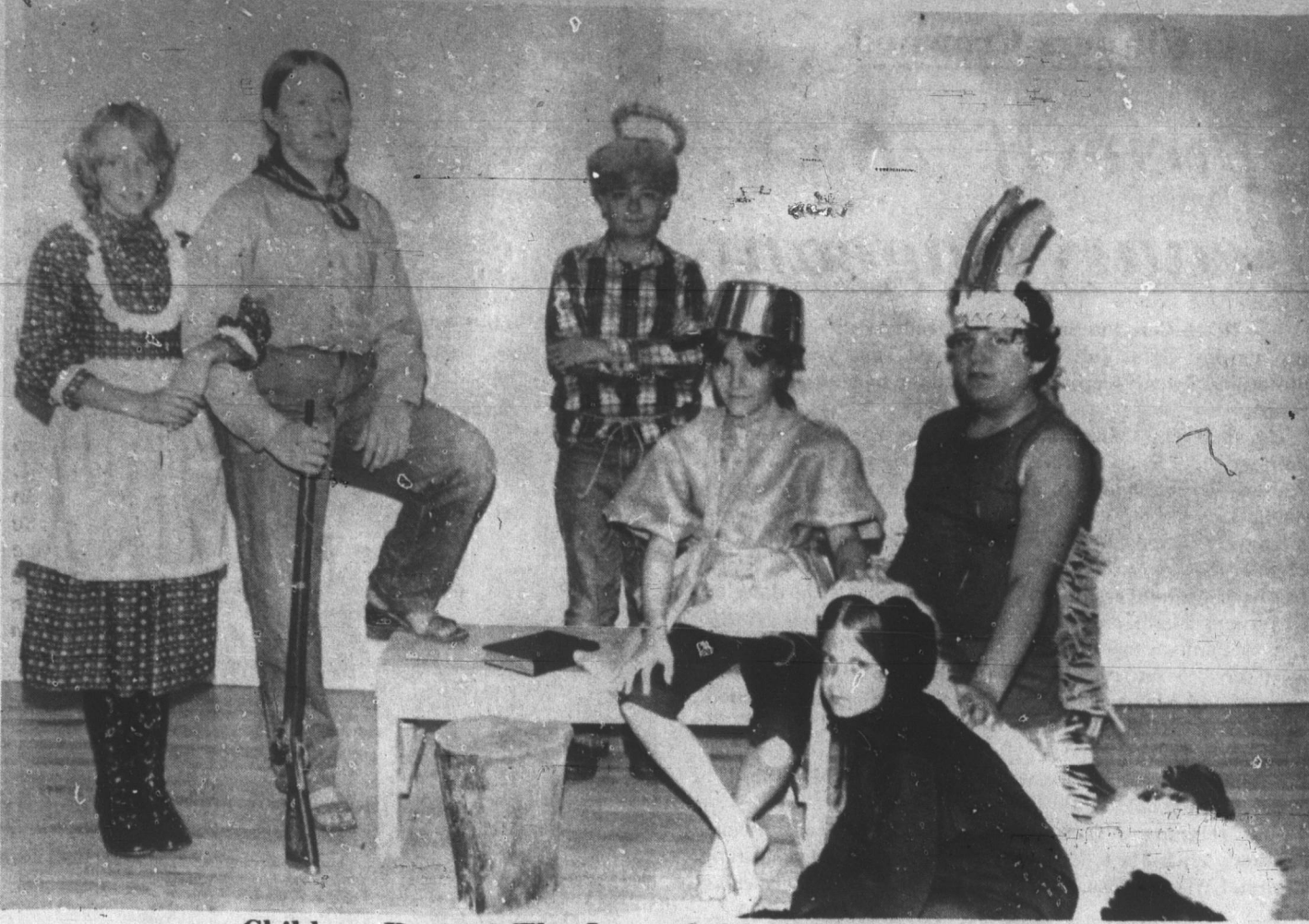
Children Present The Legend Of Johnny Applesed