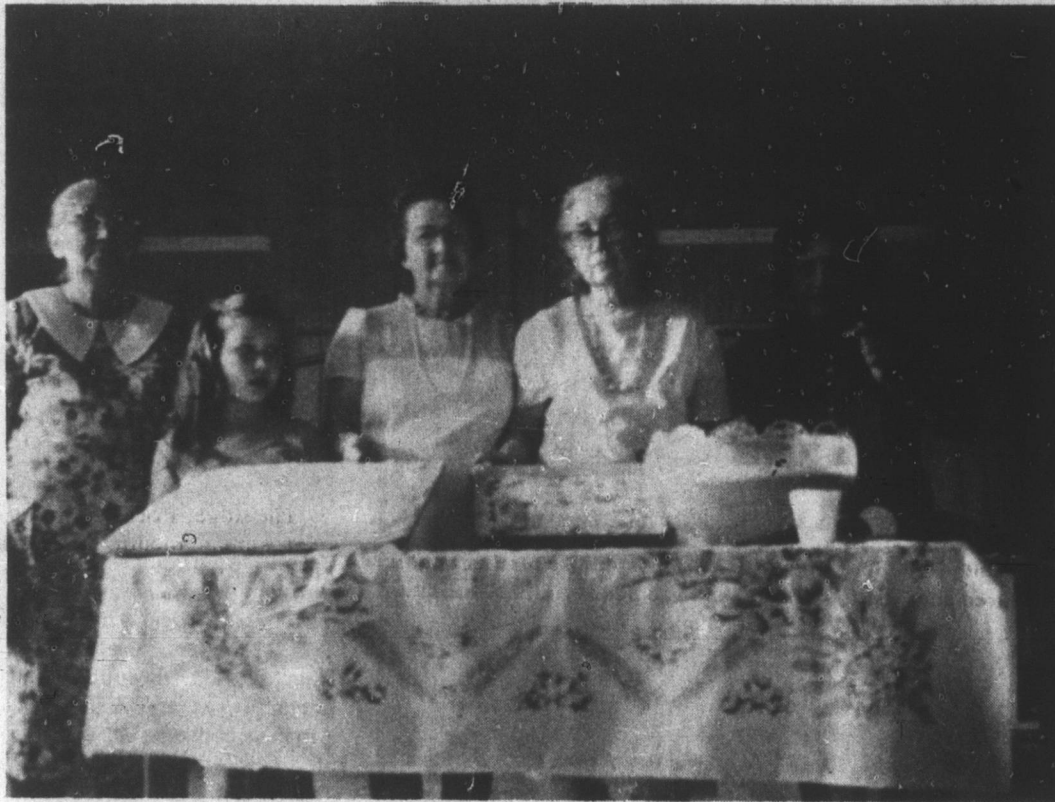
July Birthdays Celebrated

This is a Possibility-Yancey County MUST make it a reality! Attend the meeting on Thursday.