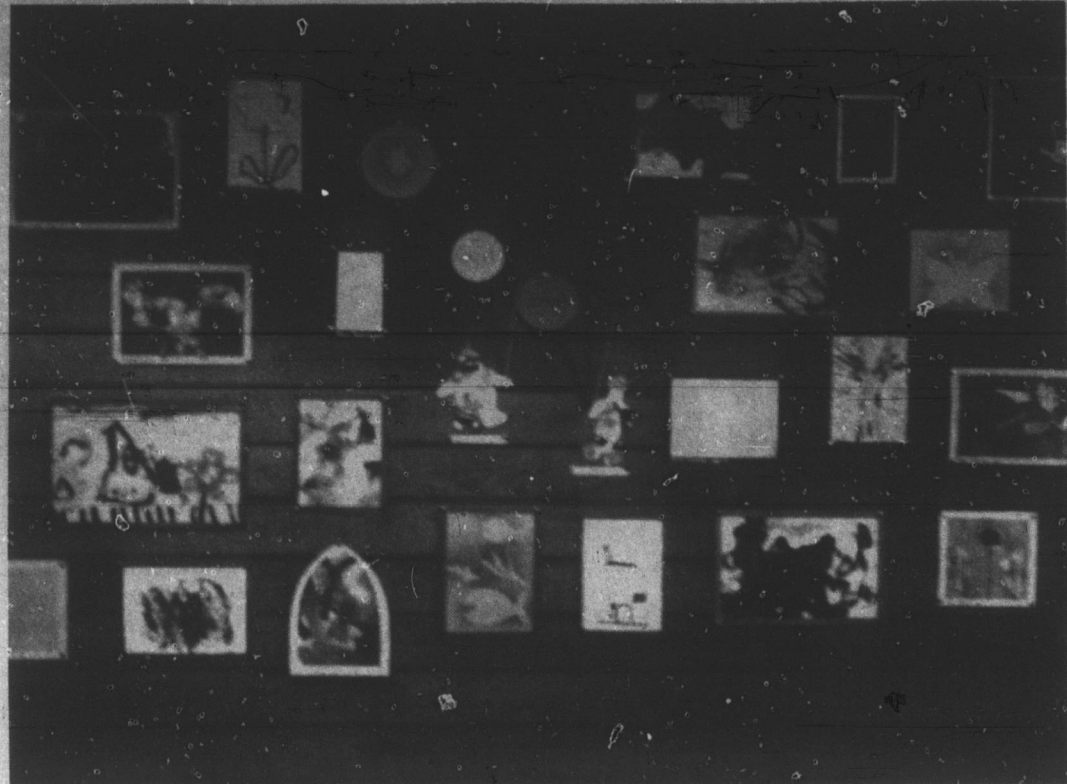
Children's Artwork Displayed In Library