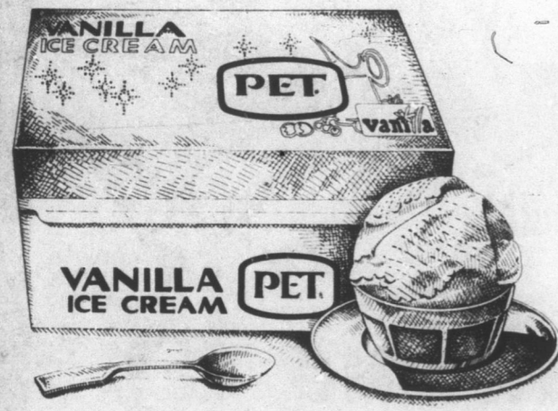
another product from PET DAIRY GROUP

So treat your taste. Treat your family. Ask for Pet Ice Cream at your favorite store. Dip into all your favorite flavors. Spoon them all up. See why so many people think Pet is the cream of ice creams.