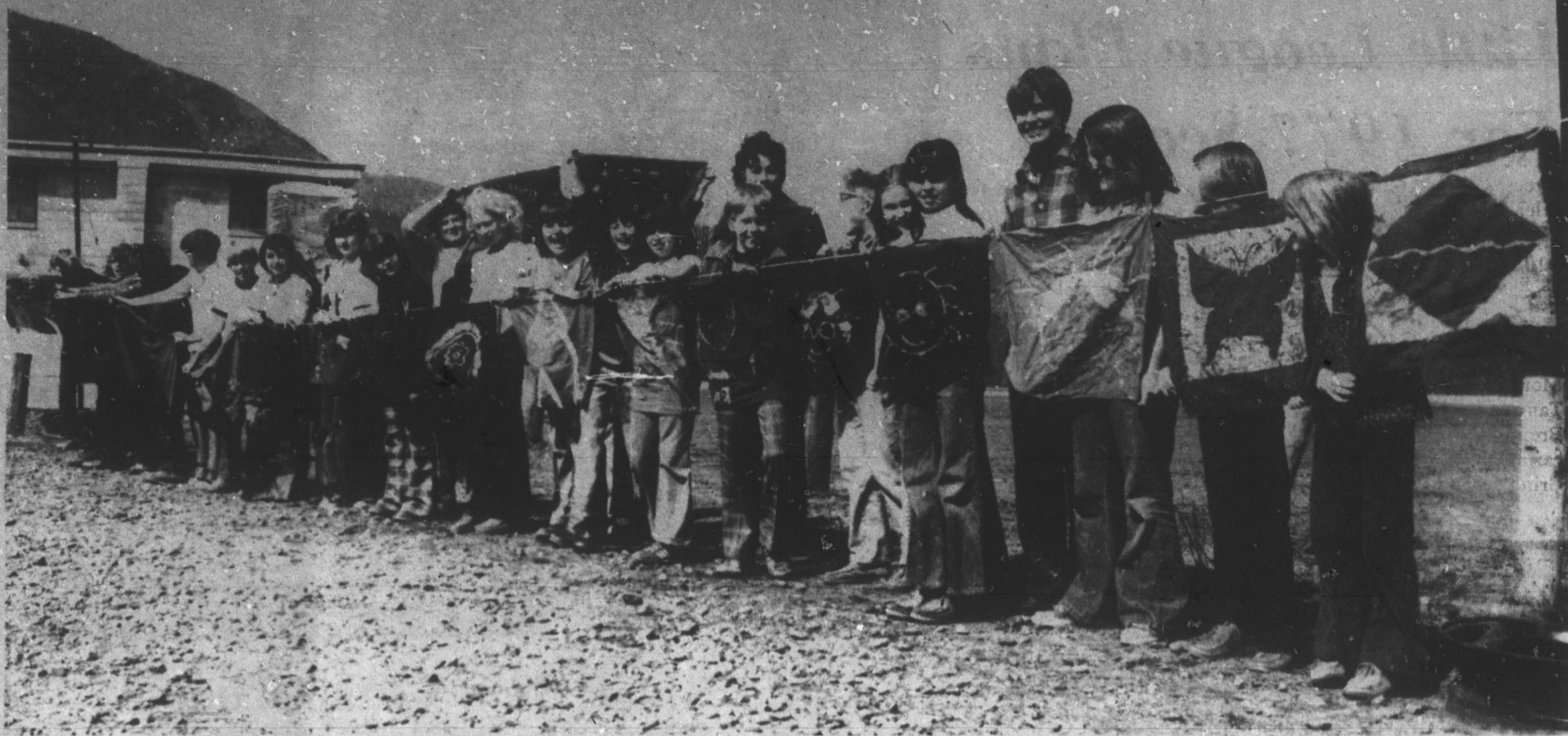
Students In Fifth Grade At South Toe School Show Scarves They Batiked

INFORMATION: CONTACT STUDENT SERVICES AT 765-7351