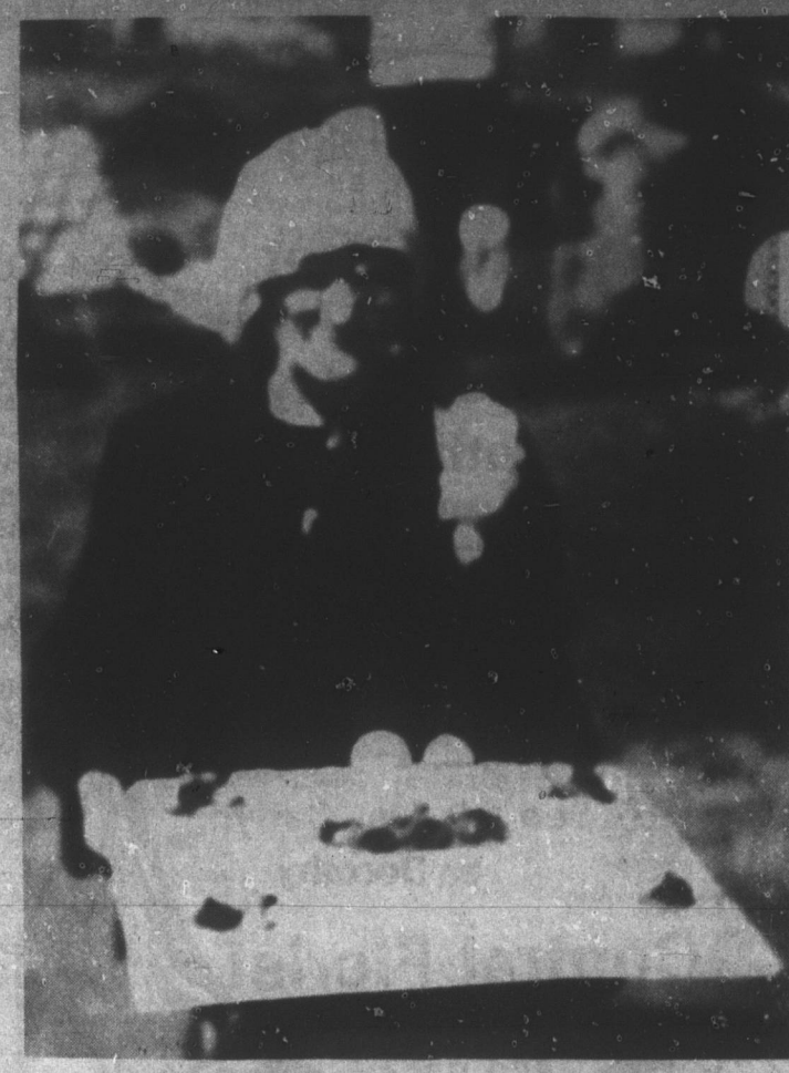
Celebrates 86th Year

Say hello to a whole gallon of sunshine-bright Mountain Dew in eight 16-oz. returnable bottles. That's more than twenty-five 5-ounce servings of Mountain Dew, the unique, lemony