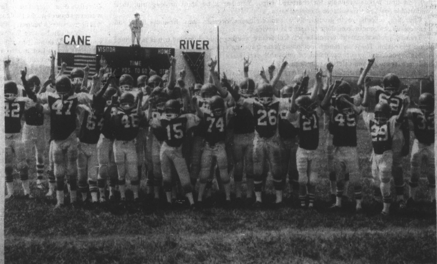
Cheers For Rebel Season!