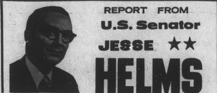
REPORT FROM U.S. Senator JESSE HELMS

Conservation District. Forestry assistance, like all programs and services of the U.S. Department of Agriculture, is available to everyone without regard to race, creed, color, sex or national origin.