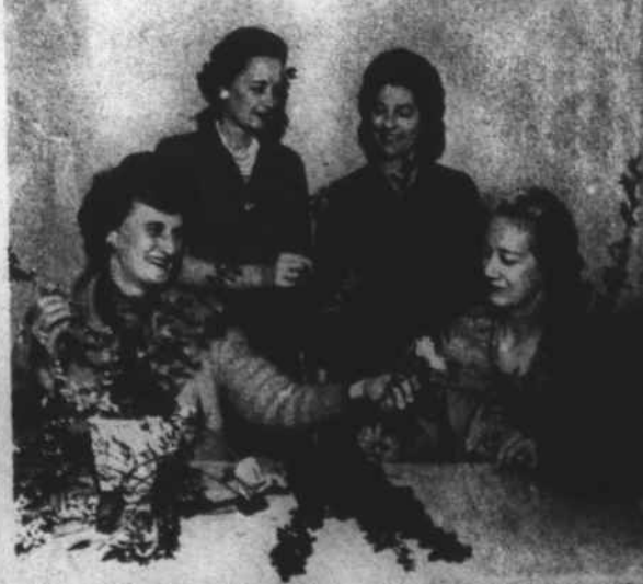
The non-competitive division consists of herbs, dried materials or any other exhibit of interest to garden clubs and non-members.

MURPHY POWER BOARD BUILDING (Thursday, April 19) 12:30 to 5:00 p.m.