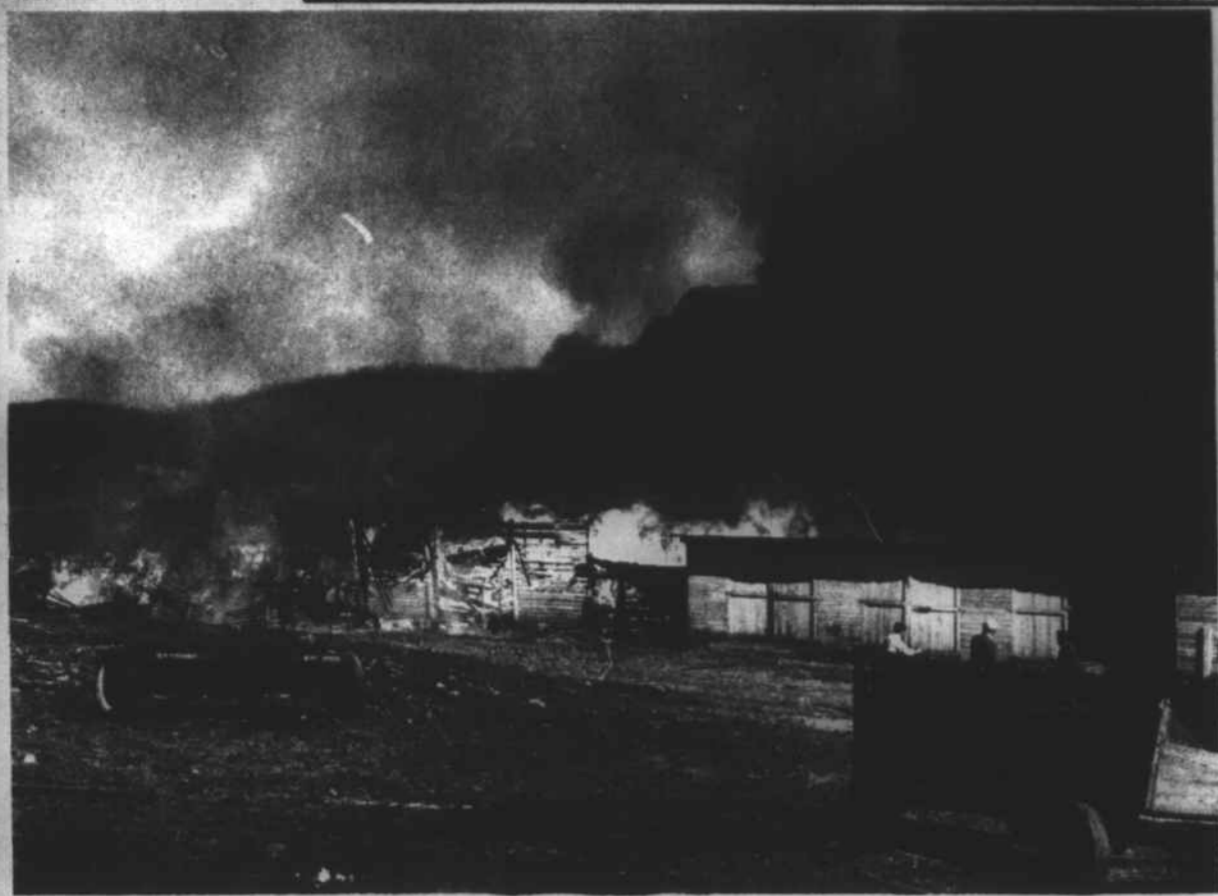
FIRE RAZES BARN - A roaring fire that sent huge bellows of heavy, dark smoke several hundred feet into the air completely destroyed the cattle barn plus several outbuildings at Mission Farm near the Cherokee - Clay County line around 3:30 p.m. April 20. W. D. Townson of Murphy owns the farm. The fire was reported by L. C. Loudermilk of the U. S. Forest Service who was spotting forest fires by airplane. It was

estimated to 5 to 6,000 bales of hay were destroyed. All cattle were saved except for two calves, and one hog. Several pieces of farm machinery were lost. In addition to the cattle barn, a machinery shed, grain house and pig parlor were destroyed. The Murphy Fire Department saved a crib containing some $8,000 worth of corn, Mr. Townson said.