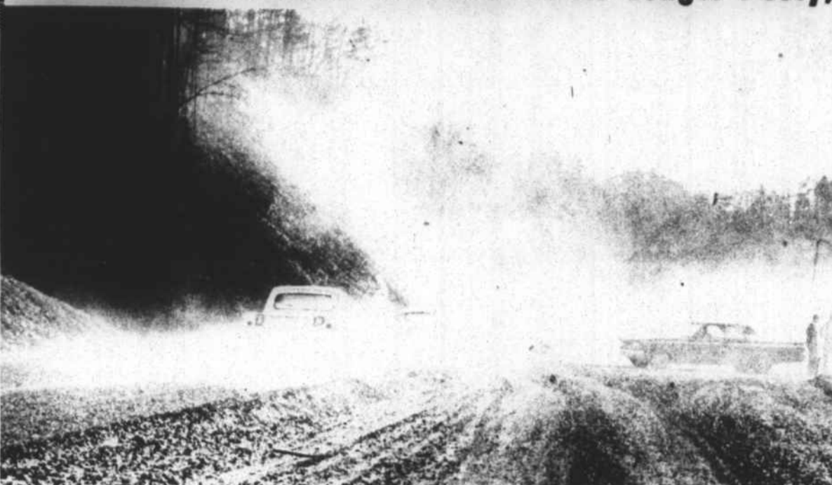
Thanks To The Daily Use Of This Water Truck.