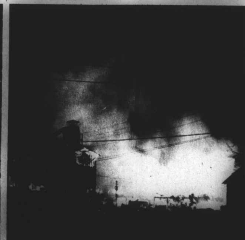
DURING... The flame, shown above shortly after 5 a.m., destroyed the metal covered frame building, the sawdust bin, and two forklift trucks. In addition, the building housed a planer, rip saws, band saws, and cut off saws used in making pallets. A boxcar along-side the mill was also damaged by the flames.