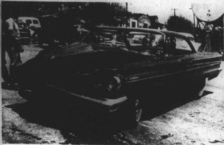
Auto Was Traveling South When It Met Truck