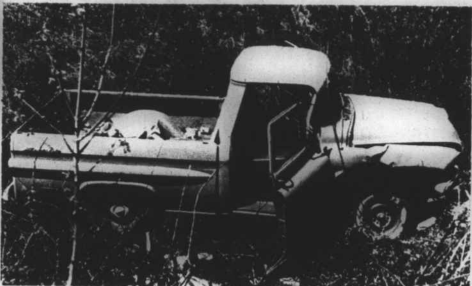
Mrs. Shook's Truck Overturned, Landed Right Side Up