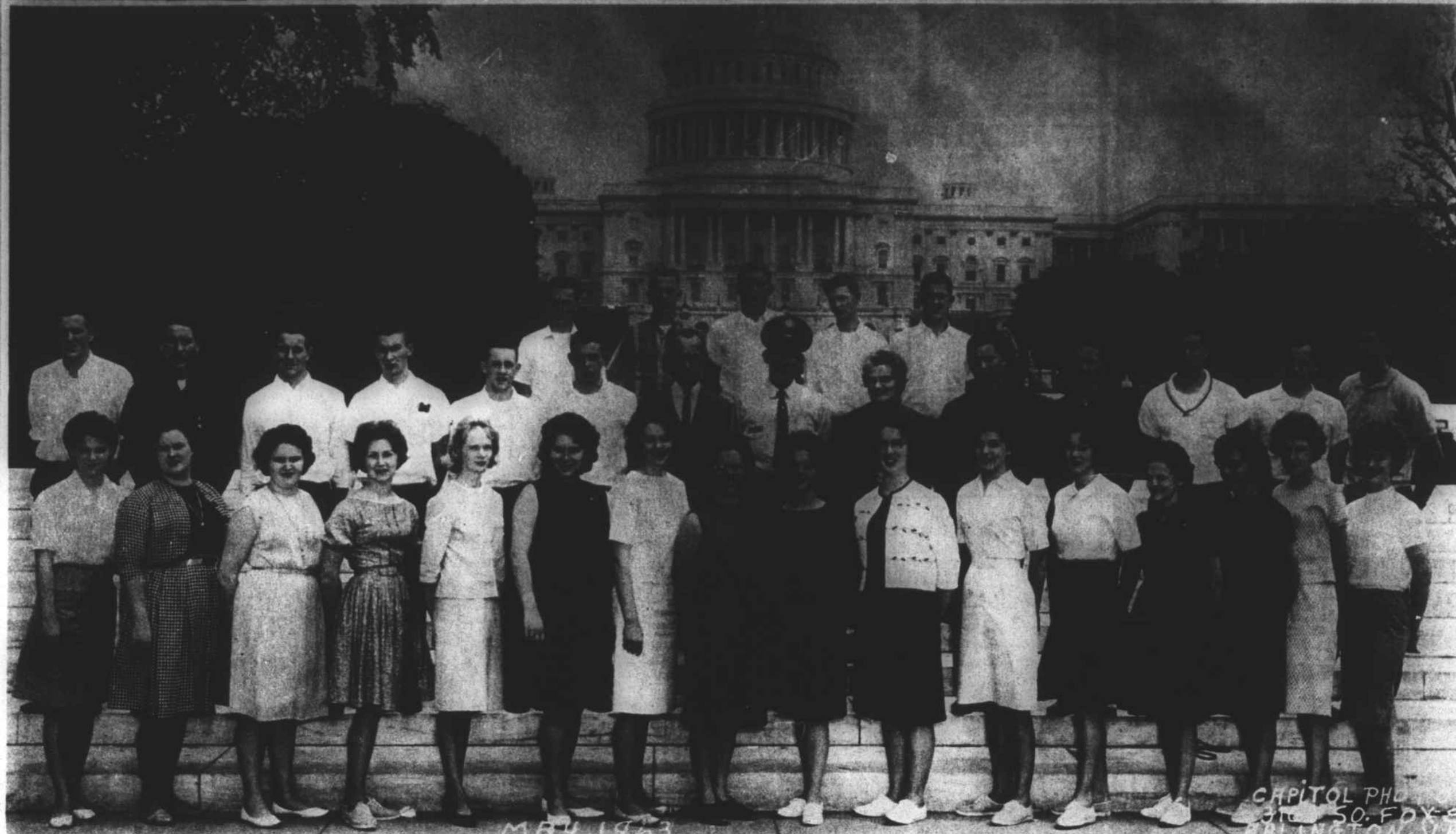
CAPITOL PHOTO BY SO. FLYER