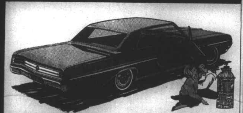
Buick Skylark: A very personal car with a flair for action. Now in 3 models.