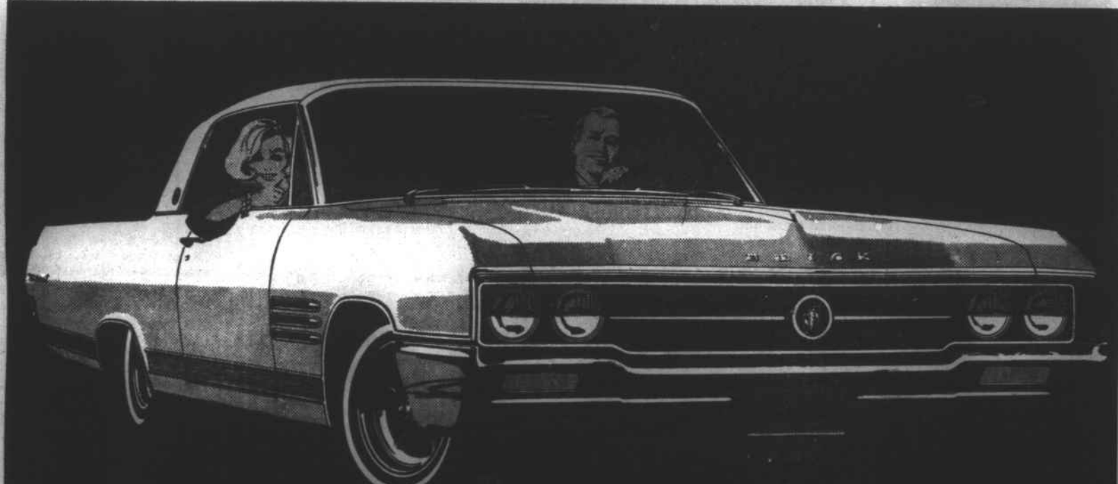
New Buick Wildcat, superbest yet. Three belts engine choices (up to 160 hp). Hot new Formula V wheels (optional at extra cost).

Everybody out of the rut ...the '64 Buicks are here!