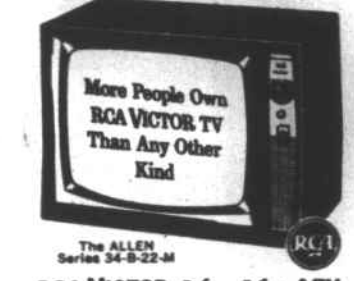
TABLE TOP BUY