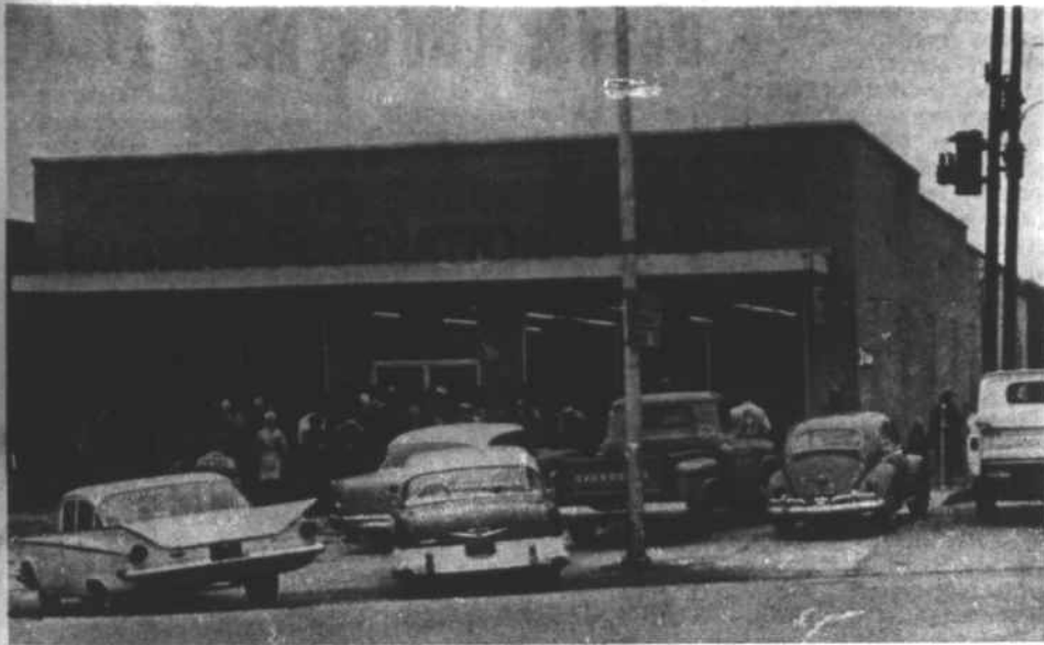
ALL THESE SHOPPERS were crowded outside the Farmer's Federation Store here Tuesday, waiting in the cold to get in and take advantage of the store's bankruptcy sale.