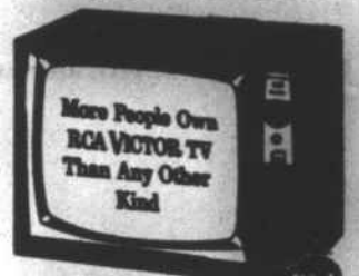
TABLE TOP BUY