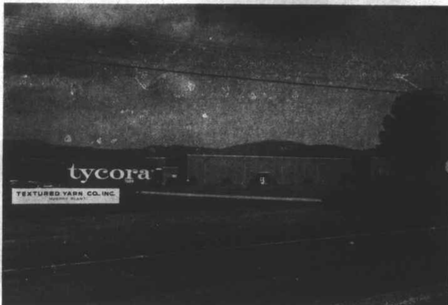
Textured Yarn Murphy Plant

Plans for further expansion are presently being made and an announcement will be made at the time they are complete.