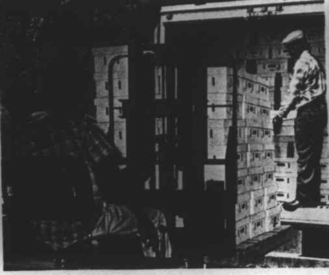
Edward Richardson load the freshly packed tomatoes into a trailer to be shipped. More than 15 tons of tomatoes are being shipped each day from the new market. Fourth Photo-