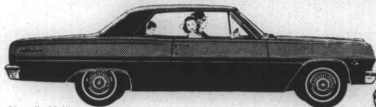
Chevelle Malibu Sport Coupe.

Now's the time to drive a great deal from a great choice of brand-new Corvairs, Chevrolets and Chevilles. Leave it to Chevrolet to make sure these beauties look costly. Leave it to your Chevrolet dealer to make sure they're not. But rush, rush, rush! They're moving out fast.