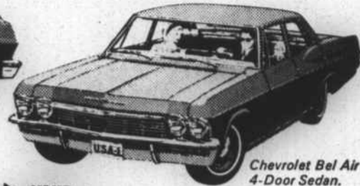
Chevrolet Bel Air 4-Door Sedan.

Now's the time to get a No. 1 buy on the No. 1 cars.