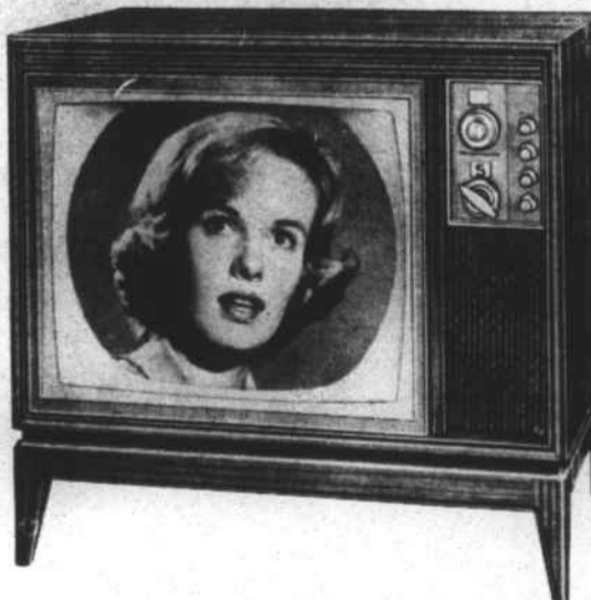
The Magna Color 21-Danish Modern, in dark walnut