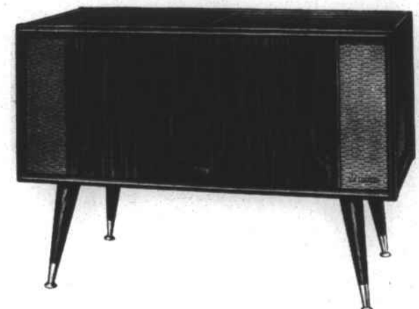
The Magnasonic X-10, in walnut finish

assembly lines. Wood finishes in walnut, cherry, and maple are to be utilized. Styling of the cabinets includes Contemporary, French Provincial, Danish Modern and Colonial.