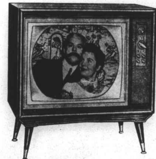
The Magnacolor 21-Contemporary, in walnut finish