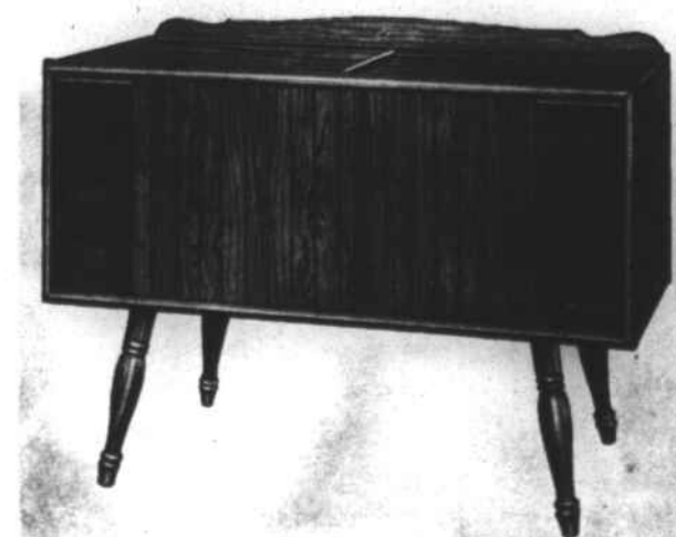
The Magnasonic X-10, in maple finish