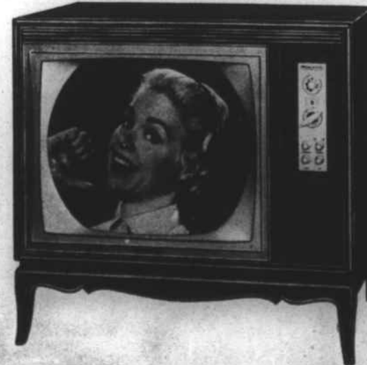
The Toulon 21-French Provincial, in distressed cherry