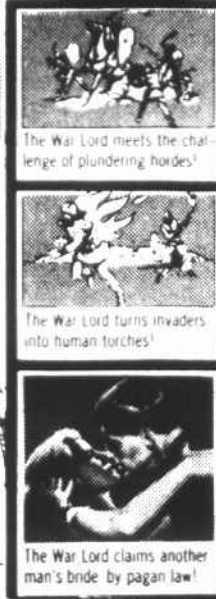
The War Lord meets the challenge of plundering horses!