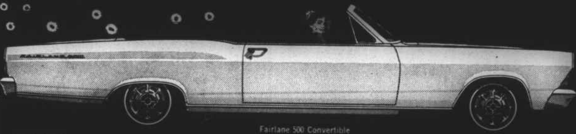
Fairlane 500 Convertible