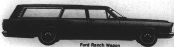
Ford Ranch Wagon

You see more people than ever in new '66 Fords because of specials like these. Specially equipped, specially priced! Fairlane 500 Convertibles and Hardtops, Ford Galaxie 500 Hardtops, and Ford Ranch Wagons. Hurry in and save!