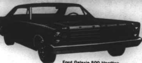
Ford Galaxie 500 Hardtop