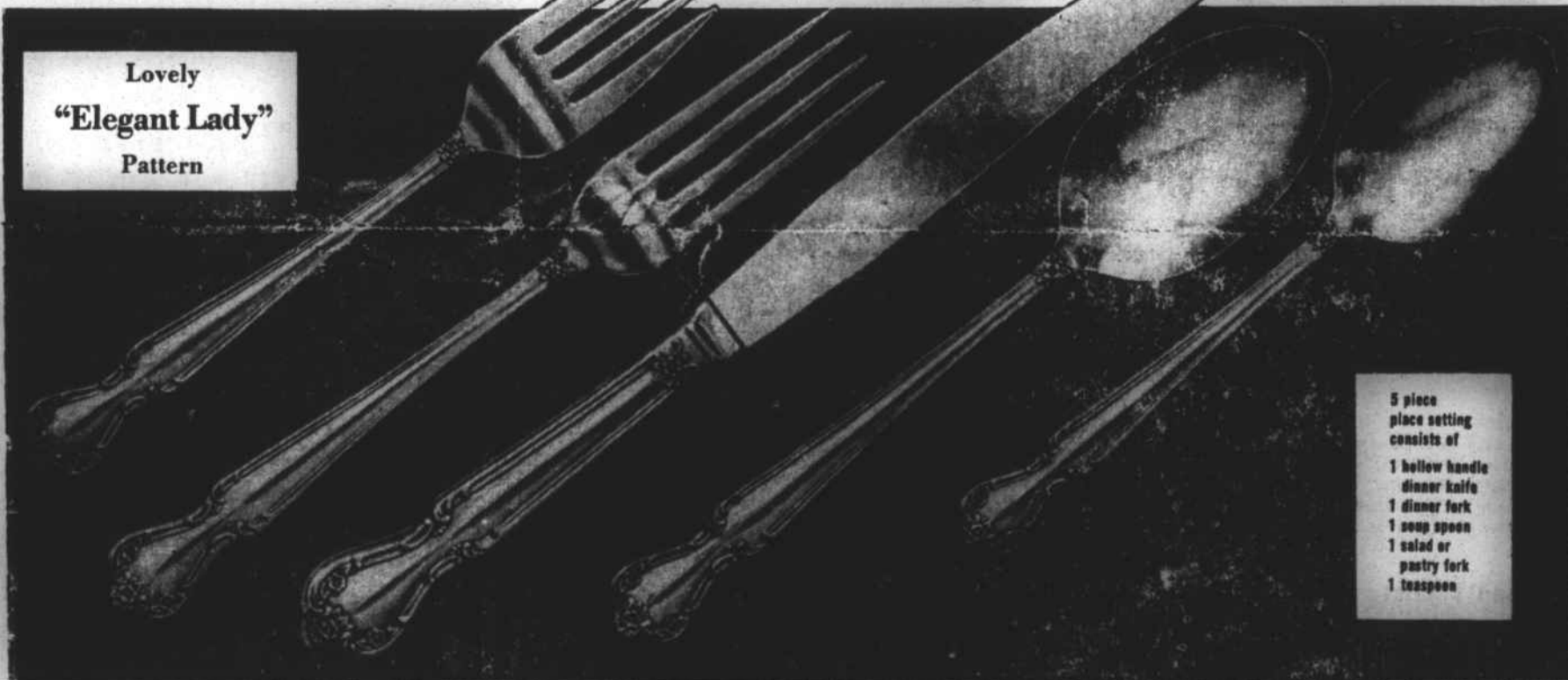
Lovely "Elegant Lady" Pattern

While you are building a handsome silver service, you are building family security too. Begin now, and soon you'll have your silver service complete and a substantial account.