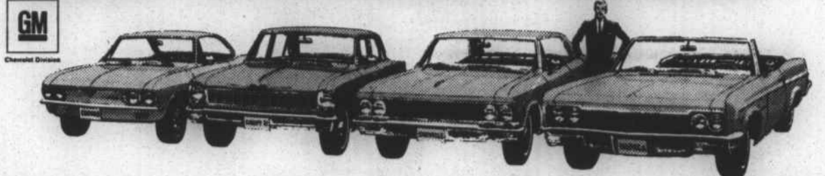
Left to right: Corvair Monza Sport Coupe, Chevy II Nova 4-Door Sedan, Chevelle Malibu Sport Coupe and Chevrolet Impala Convertible. Each comes with an outside rearview mirror and seven other standard features for your added safety. Always check your mirror before you pass.

That's the beauty of buying America's most popular make of car—especially right now when summer savings are extra tempting. It just makes sense that you're going to save in a big way by seeing the man who's doing business in a big way. So go see what your Chevrolet dealer can save you right now on a luxurious new Chevrolet, racy Chevelle, trusty Chevy II or sporty Corvair. This year's cars by Chevrolet are the most. And right now—so are the savings.