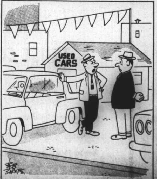
"Look, I'll tell ya' what . . . You buy it, drive it for 30 days and if you don't like it I'll help ya' palm it off on some other sucker."