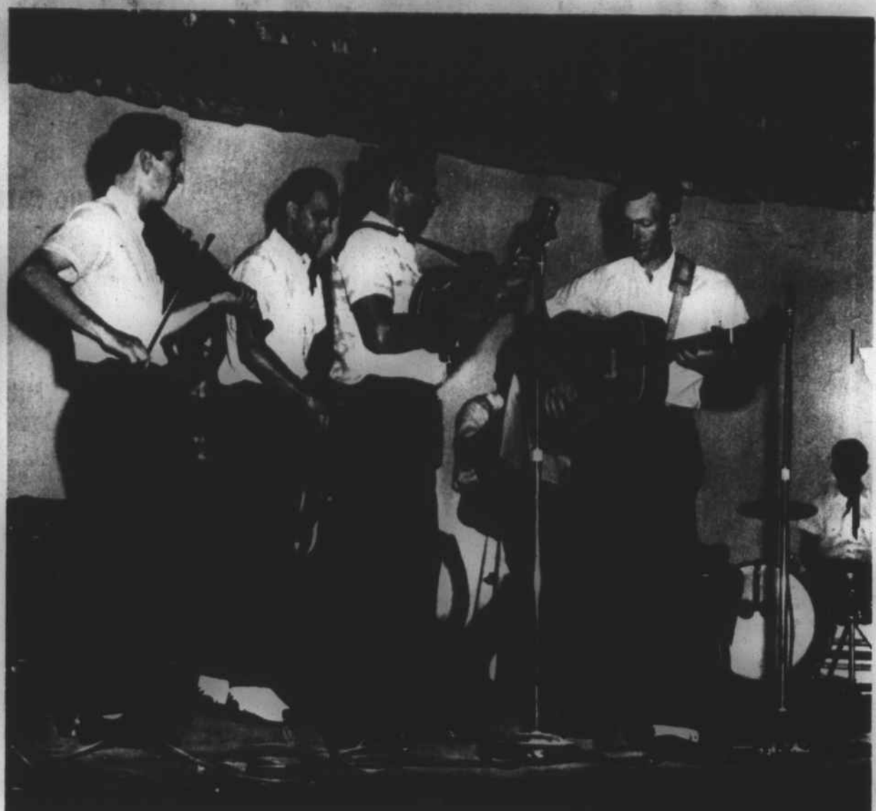
Dust off your fiddle and grab your bow -- and off to the Georgia Mountain Fair. Friday, August 12th and Saturday, August 13th, the Fiddler's Convention and Country Music Show will be held. Over 50 musicians from the hill country will provide top entertainment.