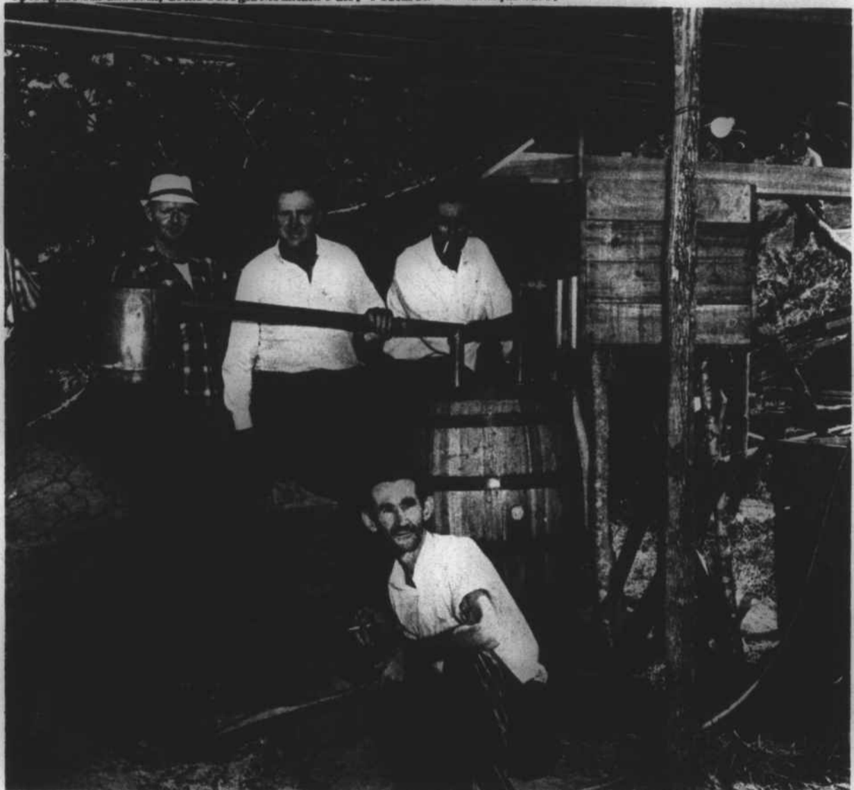
Another hand and home fashioned attraction is a Copper-hive made extinct. It is on display all week at the Georgia Mountain Fair. Still -- not in operation -- of the kind that the revenooers

On August 5, the 16th annual Georgia Mountain Fair, sponsored by the Towns County Lions Club, opens for nine exciting, fun-filled days and nights for both the young and young-at-heart.