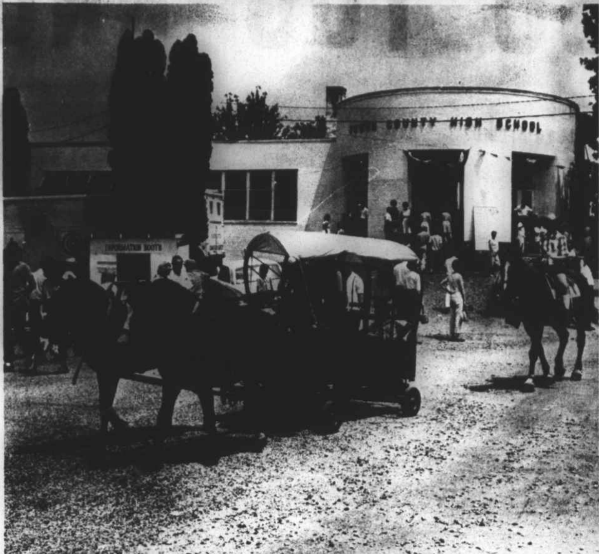
"Old Fashion Pioneer Parade" will be held at high-noon at this annual event will be horses, mules, covered wagons, on August 6th and 13th, at the Georgia Mountain Fair. Featured and antique cars.