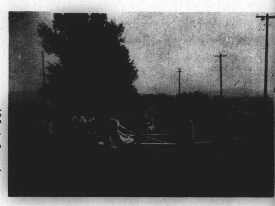
round and round goes the merry go-round for Head Start pupils at Peachtree

a teacher has, plus a willingness to learn and expand their horizons.