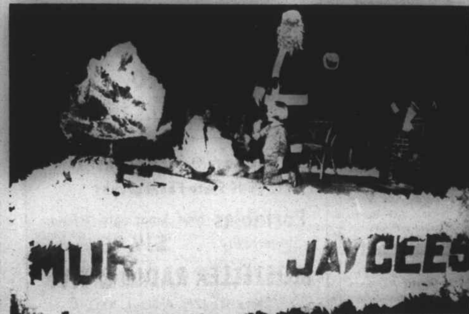
SANTA CLAUS CAME TO TOWN in last Friday's Christmas Parade. He was riding the Jaycee Float (left photo). The Ch-