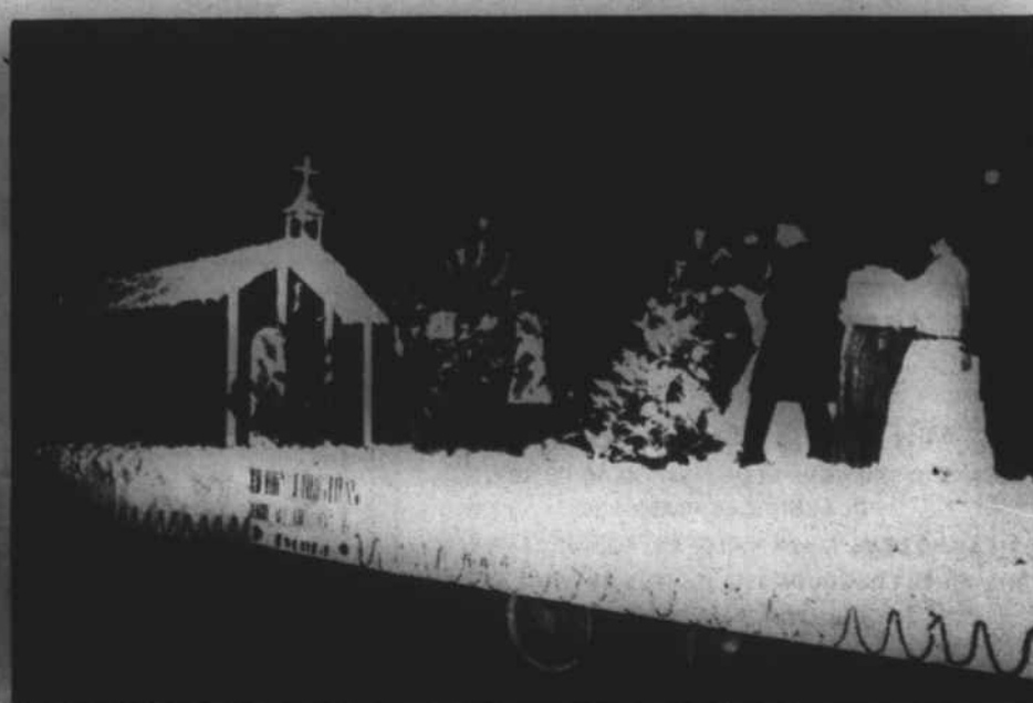
commercial division went to the Tycors Float (right photo.)