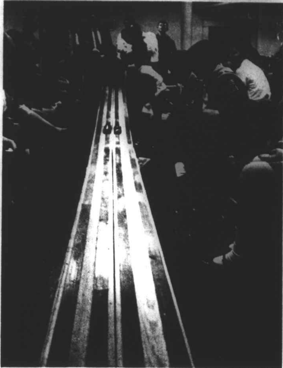
THEY'RE OFF AND RUNNING-Cub Scout Pack 405 held its Pinewood Derby on March 27 in the Fellowship Hall of the First Methodist Church.

GOLDEN OPPORTUNITY SALES GUARANTEED RENEWAL FOR LIFE. HOSPITALIZATION PLENTY OF LEADS CHANCE TO BECOME QUICKLY BRANCH MANAGER. TERRITORY OPEN AND WAITING FOR YOU. TOP PAY SCHEDULE. A SOLID FUTURE FOR YOU AND YOUR FAMILY IN AN OLD AND LARGE COMPANY TO WORK FOR. WE OFFER THE ABOVE TO MEN OF GOOD CHARACTER AND WILLINGNESS TO WORK. NEW OFFICE JUST OPENED AND OPPORTUNITY CREATED. WRITE SALES MANAGER, P.O. # 32, ROBBINSVILLE, N. C.