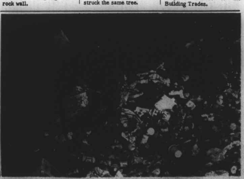
Pretty Ugly Picture Photo Editorial THIS UNSIGHTLY GARBAGE DUMP is one of two that exist on old US 64 in the Cane Creek Community. The tin cans line the edge of the road and the car frame shown at the left is just a few feet off the road. The Scout believes this picture tells of an important need in Cherokee County--public dumps for the many residents who live in areas of the county where such facilities are not available now.