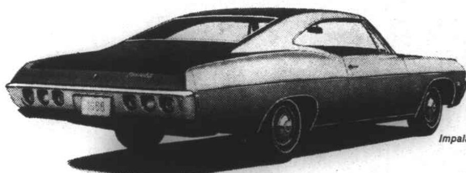
Impala Sport Coupe

Distinctively new! Fastback or formal. Both '68