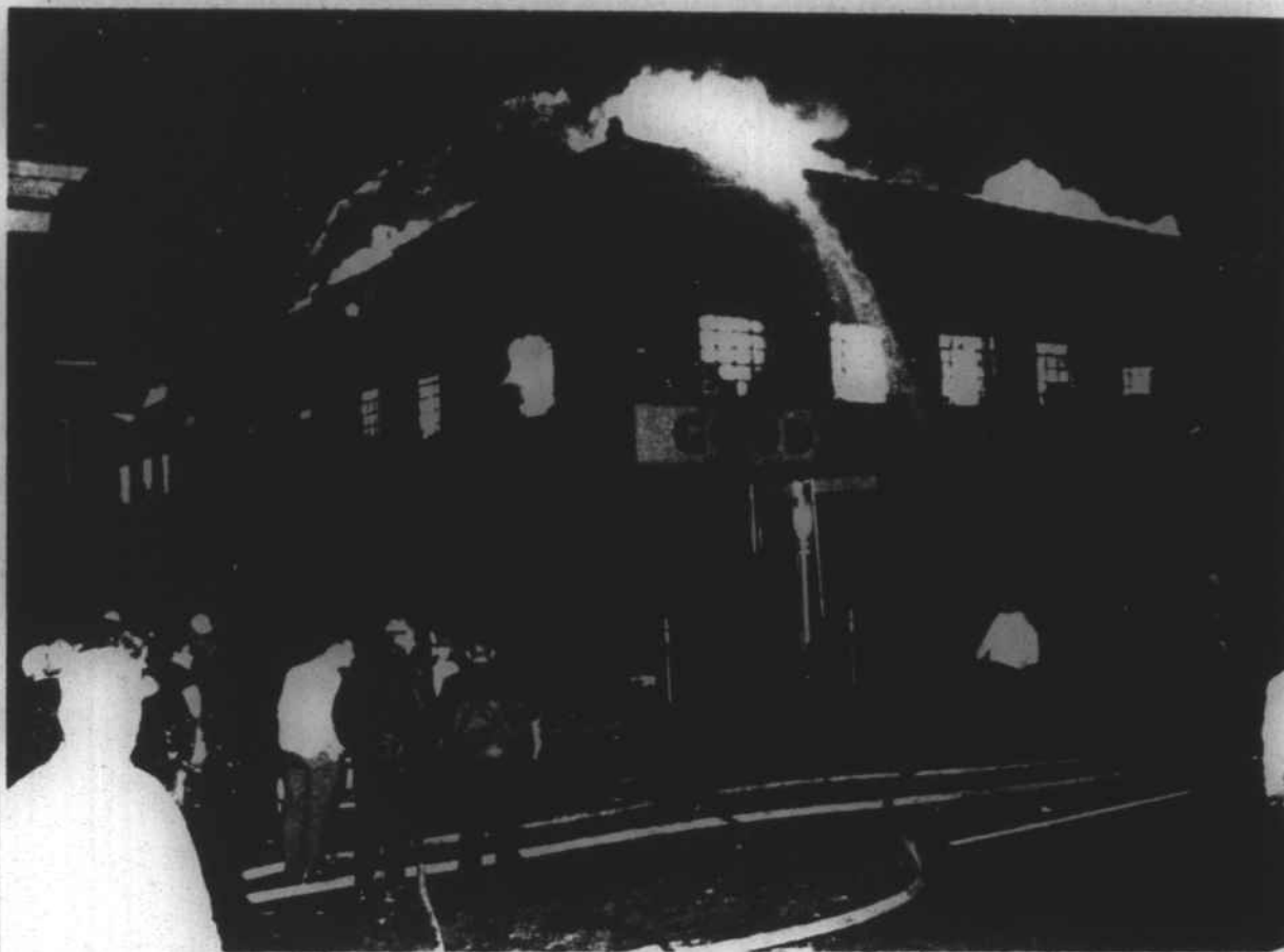
FLAMES LEAP THROUGH THE ROOF of the Townson Building as firemen from Murphy and Andrews battle to contain the blaze. Ten businesses and offices were destroyed by the fire.