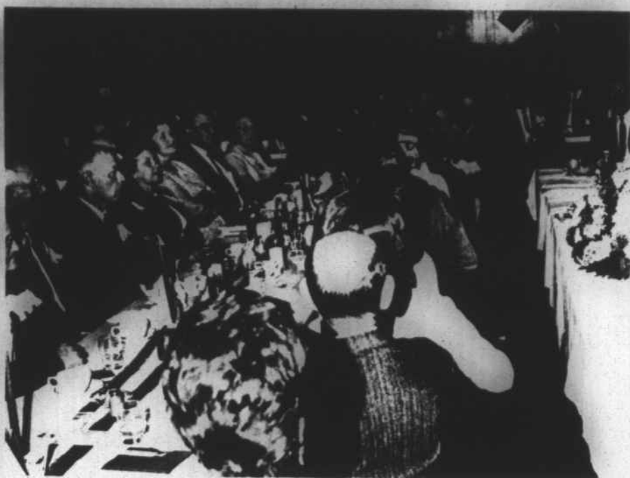
AN OVERFLOW CROWD of Republicans from Cherokee, Clay and Graham Counties gathered Saturday night at O'Dell's in Murphy for the annual Lincoln Day Dinner.